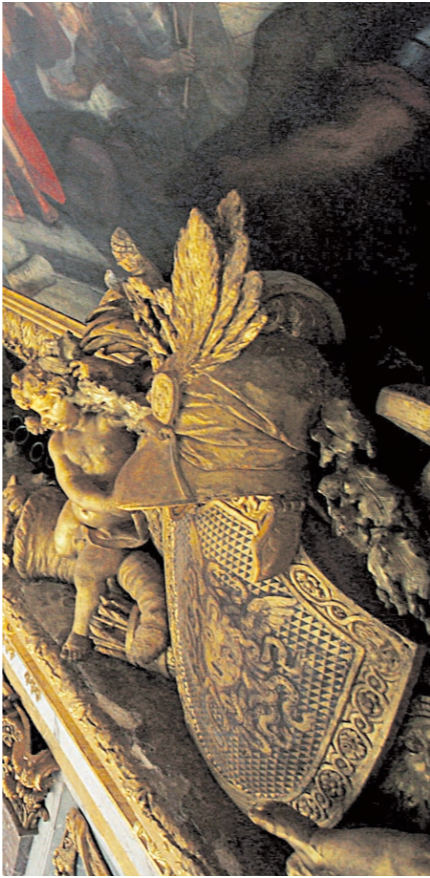
Left, the Hall of Mirrors; above, carved ornamentation; center, a restoration worker; top right and below, statues bearing unseen candelabras; right, the view overhead.