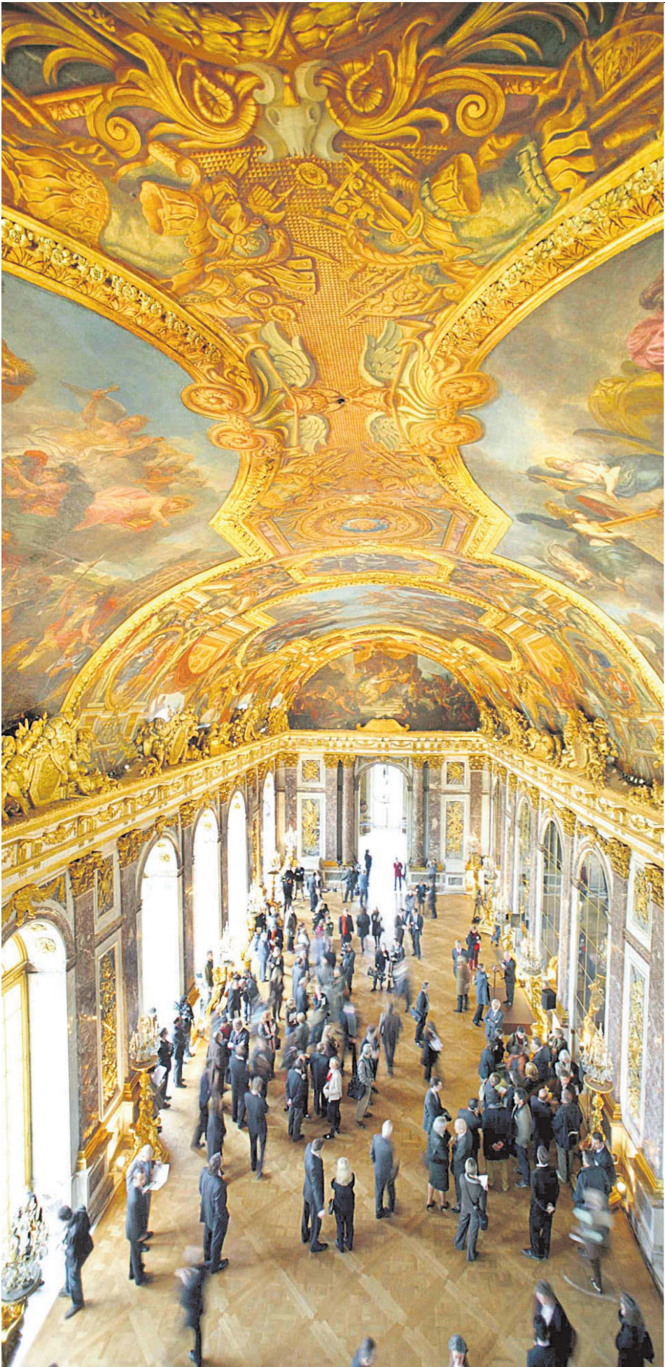
Clockwise from above: Charles Platiau/Reuters; François Guillot/AFP; Vinci/AP; Platiau/Reuters; Guillot/AFP; Vinci/AP