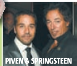
PIVEN & SPRINGSTEEN

Bling was the word of the night as a throng of guests including DEMI MOORE, ASHLEY OLSEN, MISCHA BARTON AND EVE kicked off Fashion Week decked out in massive jewels at the Van Cleef & Arpels bash celebrating the brand's new collection. Celebrity stylist RACHEL ZOE , fingering her large gold and diamond necklace, gushed, "This is vintage Van Cleef. I want to sleep with this." In addition to